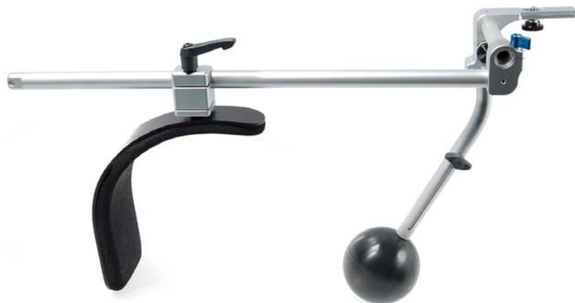
DV Balancer® compact for transport