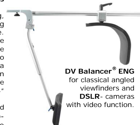
DV Balancer® ENG for classical angled viewfinders and DSLR- cameras with video function.